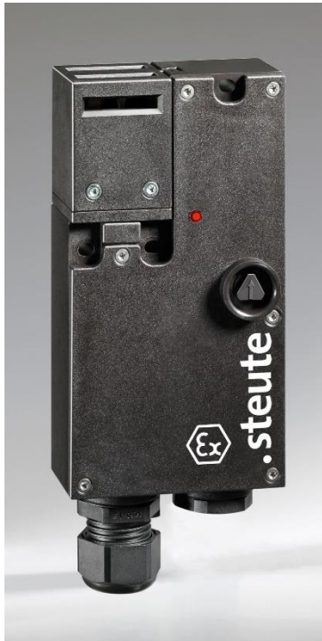
Fig. 2: Tried and tested, compact: the Ex STM 295 Ex safety solenoid interlock.