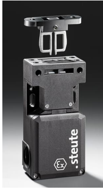
Fig. 4: Safety in Ex zones is provided by e.g. the Ex AZ 16, a safety switch with separate actuator and separate terminal compartment.