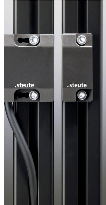
Fig. 5: As an alternative for electro-mechanical guard door monitoring, non-contact safety sensors are also available – in Ex versions.

compact design, this makes installation very flexible, not least because mounting can be in any position.