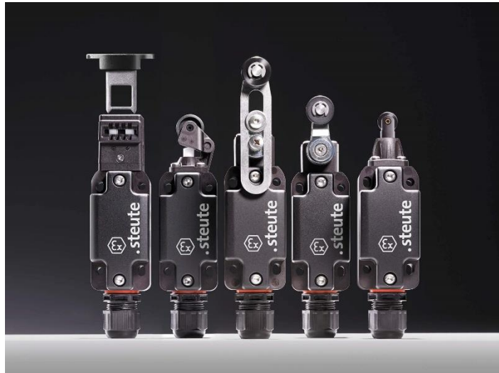
Fig. 3: Impact and shock-resistant, perfectly sealed and suitable for temperatures down to -60°C: the Ex 99 series of Ex position switches with safety function.

There is thus a need for solenoid interlocks which are compatible with dust-Ex zones, and it therefore makes sense for a medium-sized manufacturer of both Ex switchgear and safety switchgear to meet this need in the long term