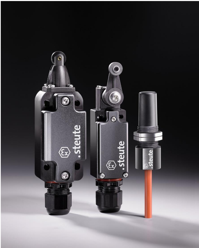
The Ex 97/ Ex 99 Ex position switches and the Ex RC M20 KST Ex magnetic switches are suitable for use in subzero temperatures down to -60°C.

fixed or a variable range, with heating lines, with vapour recovery. To balance the conveyor systems, customers can choose between hydraulic, pneumatic and electrical drives, as well as manual systems, for example with spring cylinders or counter-weights. The technical components and systems for this kind of handling equipment are always complex: the loading arms are equipped with several – usually four – swivel joints which must be exactly sealed because of the explosive gases, liquid fuels like petrol, or chemicals which are being loaded.