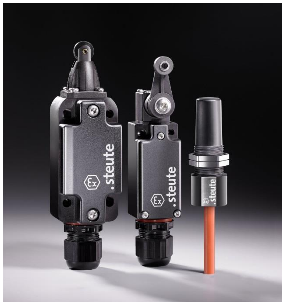
Ex 97/Ex 99 position switches and Ex RC M20 KST magnetic switches are well suited to temperatures down to -60 °C

T he transportation of fuels, gases and chemicals requires special loading systems which can handle large quantities of these materials both reliably and flexibly – for example from the production plant to rail tanks, from rail tanks to the depot, or