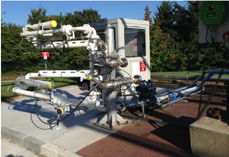
Emco Wheaton in Kirchhain designs and manufactures loading systems for fuels, gases and chemicals which are used all over the world