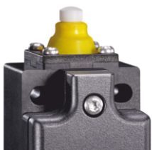
Plunger with collar W