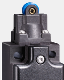
Roller plunger R

Material no. 1292311 1430320 on request 1430318